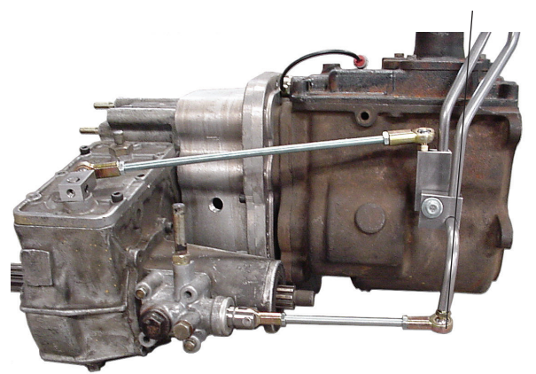
Vertical alignment of Part numbers 715588 & 715587

Now weld each handle to its corresponding shift block, as shown. Mode shift link P/N 715588 comes pre-bent, but the distance it sticks out of the mode block (P/N 715577) needs to be set for your application. Weld the mode shift link to the mode block so that it is in-line with the mode shaft (P/N 715585) and so that the link is parallel to the long edge of the block (straight down). See pictures "vertical alignment" and "horizontal alignment" below for a visual description. Note that the mode shift link may need to be cut on the non-threaded end to achieve the desired alignment.