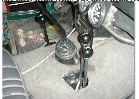
Twin sticks through modified hole in floor.

Now install the two 3/8" jam nuts and ball joints onto the 3/8" all thread and bolt this assembly to the high/low shift handle and arm. Adjust the length so that the handle is pointing straight up when the transfer case is in neutral. Cutting of the all thread may necessary to achieve this. Repeat this same process for the mode shifter assembly using the ball joint, jam nut, and male heim joint. The male heim joint mounts to the mode shaft with the supplied clevis pin and cotter pin.