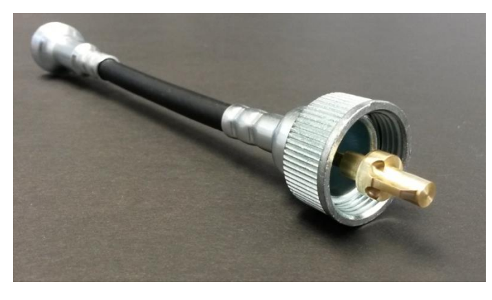
7/8" thread-end of cable assembled with brass tang